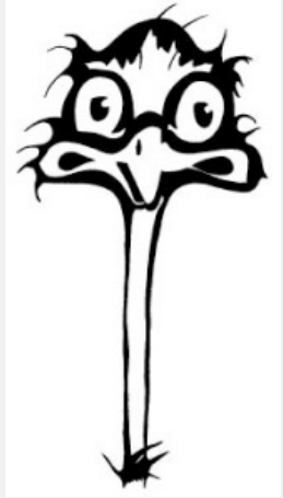
Joakim's father's drawing of the ostrich

Now and then this bird changes, and sometimes also the names of the pedals, which more or less reflects the mood of the day or season. Even if It's a great joy making all the way original pedals it's possible to get a little bored with some details. Therefore these changes can occur, at any time. It's also a good way for developing new pedals. Some variants of the bird are: