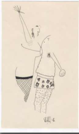
The original artwork from 1986

The bird layout was quite a coincidence. As the ending of the word “HimmelSTRUTZ” reminds of “STRUTS” (=ostrich in Swedish) the artwork just had to be like that. My dad arranged the original artwork, which looked like this: (See right)