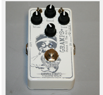
Gramps+ Fuzztortion Grande