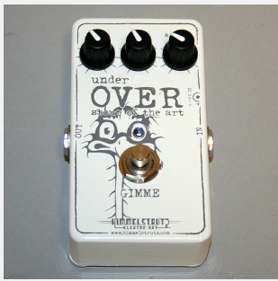
Under Over booster

I would say it works the way you want it to work. Personally I like to switch the order of most of them, depending on what to be solved that specific day. Some times I need to boost a drive pedal – why not with some extra pre eq, “ under OVER ” (UO), and other days I prefer to route the boost/eq – and/or the opto dynamic booster, “ miss nutCRACKer ” (MNC), after the dirt section which would be a “ FETTO “, “ GRAMPS+ “