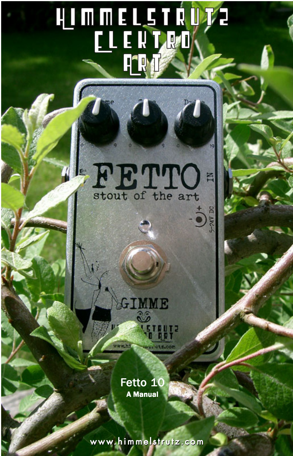
Fetto 10 A Manual